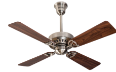
Brushed Nickel with Walnut Blades