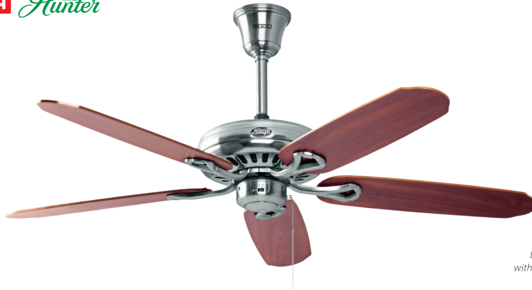
Brushed Nickel with Cherry Blades