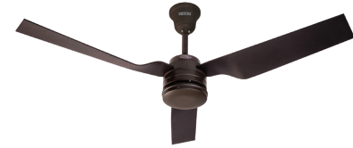
New Bronze With Coffee Beech Blades