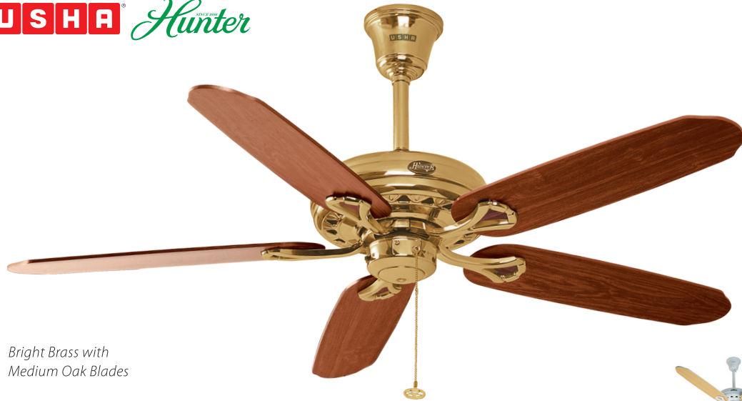
Bright Brass with Medium Oak Blades