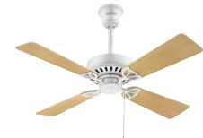
White with Oak Blades