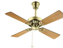
Bright Brass with Oak Blades