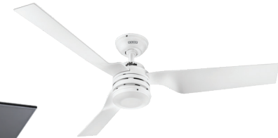
White with White Blades