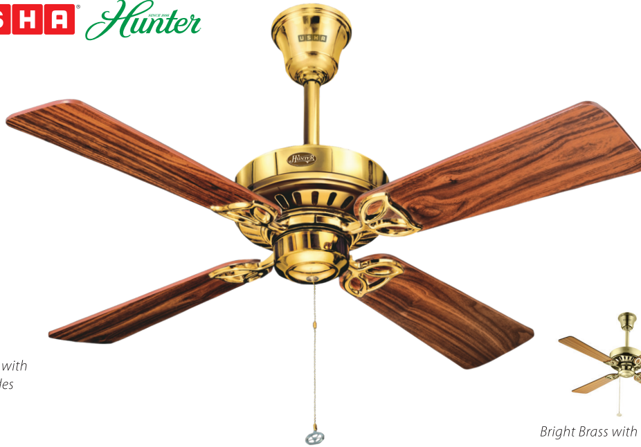
Bright Brass with Walnut Blades