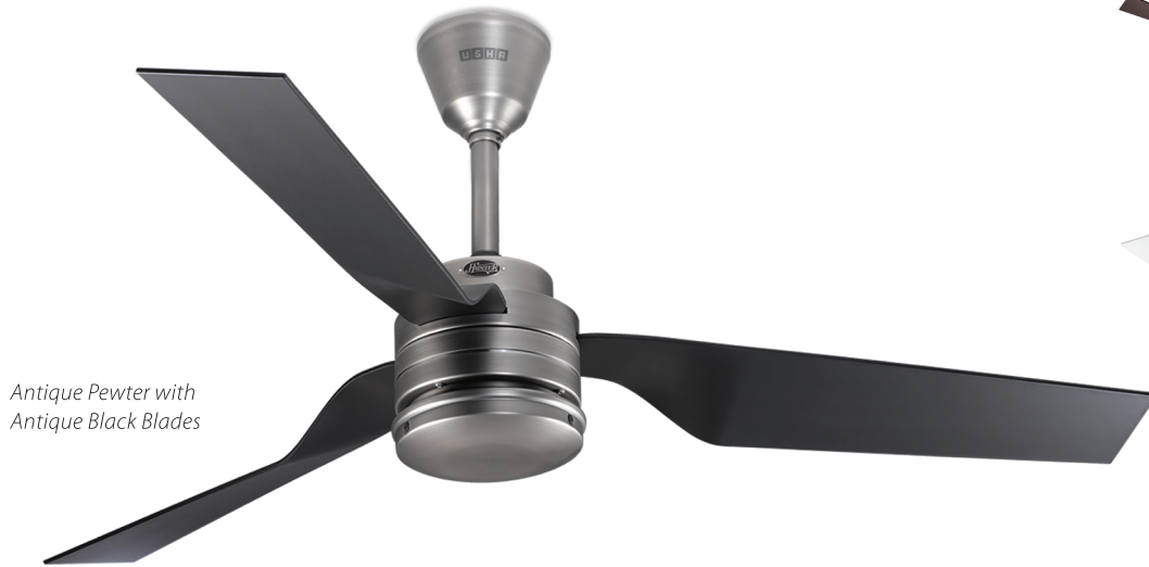
Antique Pewter with Antique Black Blades