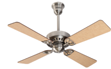
Brushed Nickel with Oak Blades