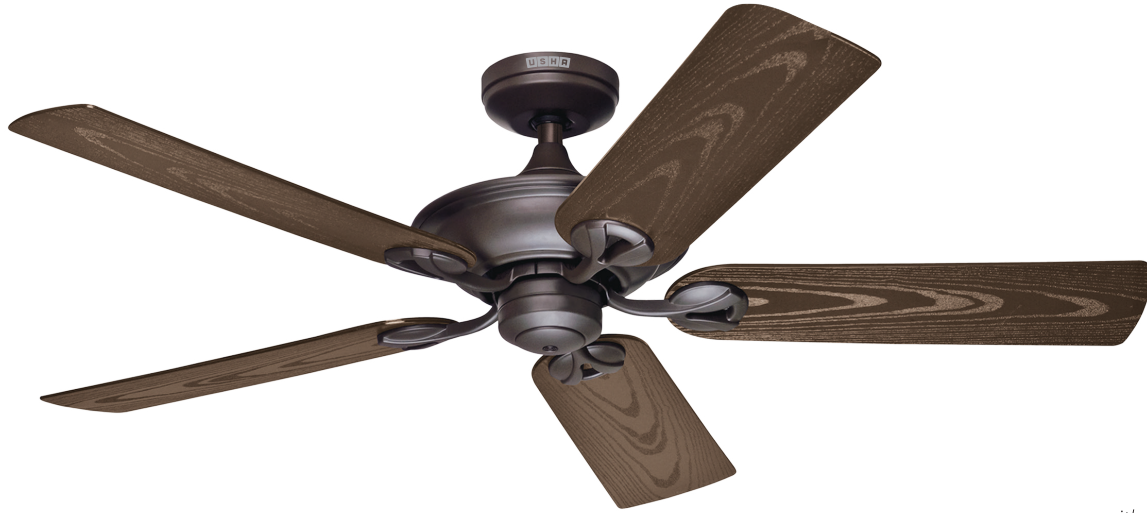
New Bronze with Walnut Blades